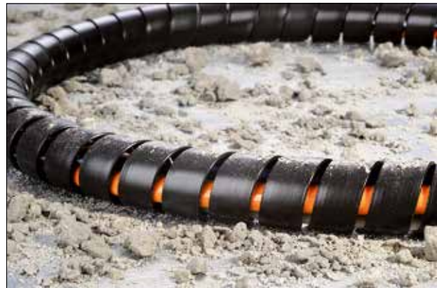
SPF spiral binding is extremely robust and abrasion resistant.