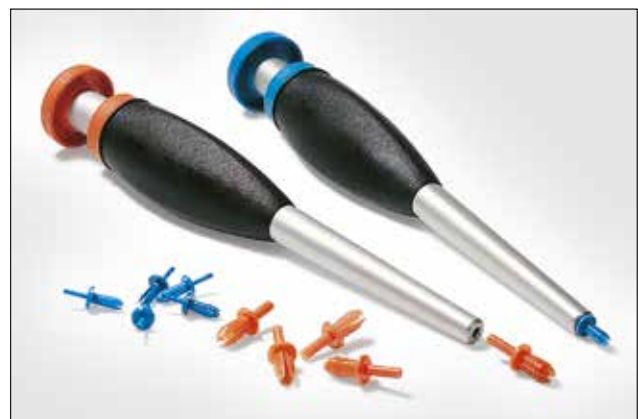
Rivet Tools HTWD-RT4, -RT6.