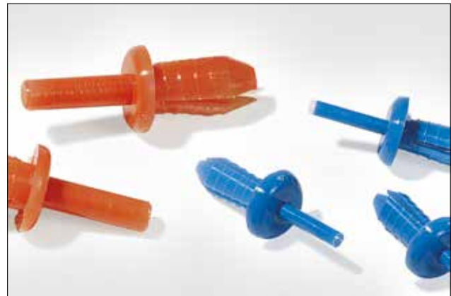
HTWD-R4 and HTWD-R6 Rivet.