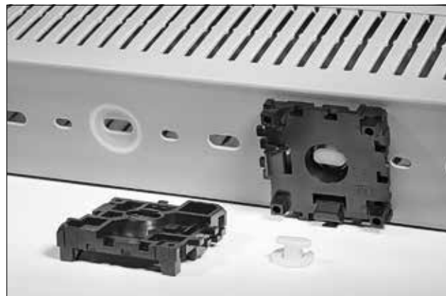
HTWD-RB rail mounting blocks for mounting ducts to DIN rails.