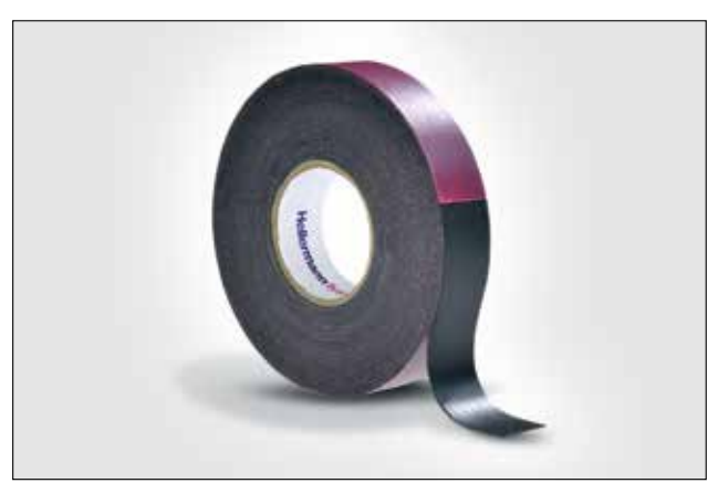
HelaTape Power 600 is a self-amalgamating low voltage rubber tape.