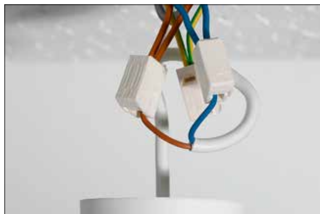
Quick installation and release of lights with HelaCon Lux.