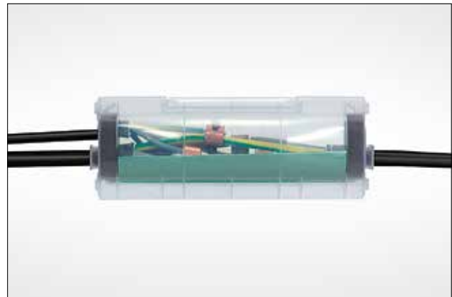
Parallel branch joint PA-13 95/420.