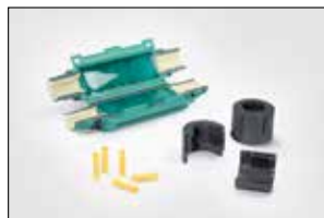
Gel cable joint Reliseal V 56.