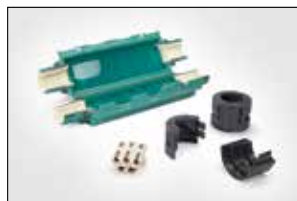
Gel cable joint Reliseal V 525.