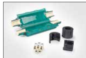
Gel cable joint Reliseal V 510.