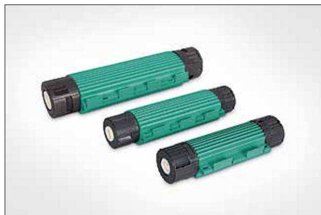
Reliseal gel cable joint, available in three sizes.