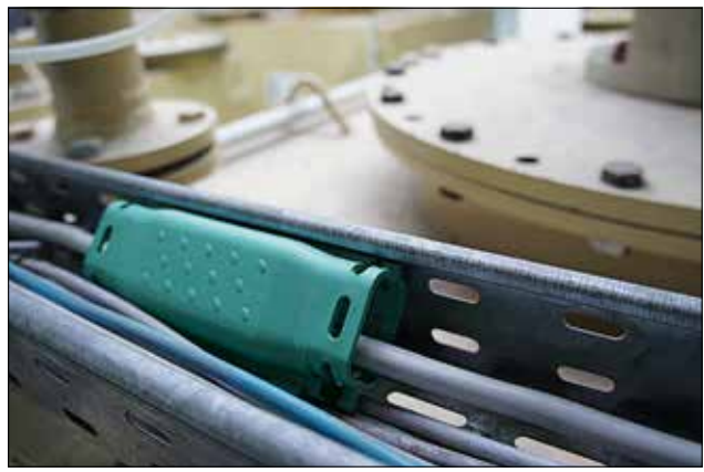
Relicon Relifix V gel cable joints