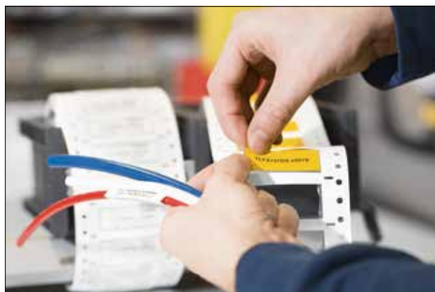
Shrinkable rail approved markers TLFX DS.