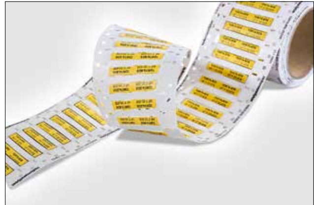
Shrinkable rail diesel resistant markers TDRT DS.