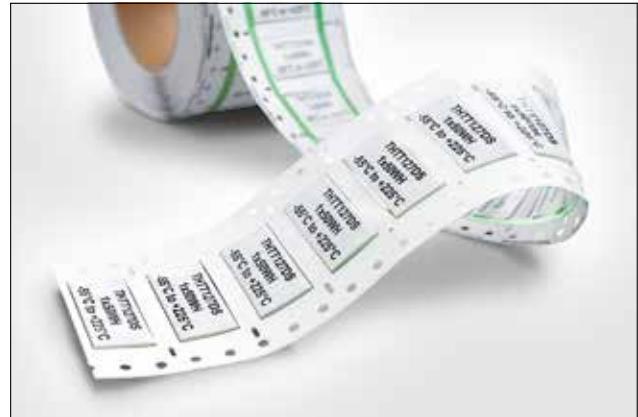
THTT DS - High temperature heatshrink printable marker.