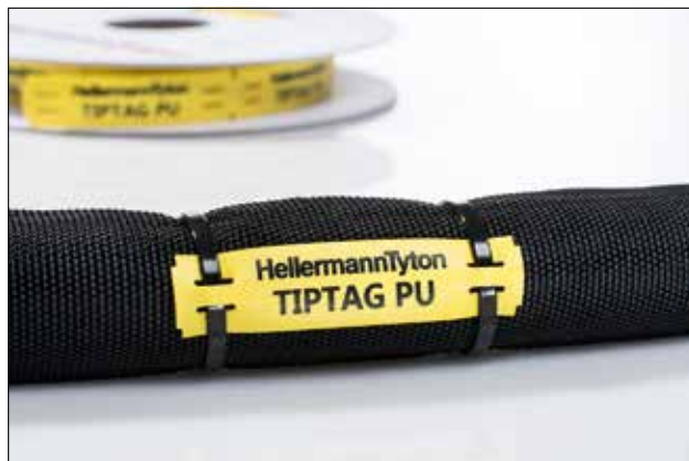
TIPTAG PU - The printed mark has a tattoo-like permanency.

A special ribbon has been developed for Tiptag PU to create a "tattoo" effect so that the marking cannot be rubbed off and is particularly durable and resistant to harsh abrasion.