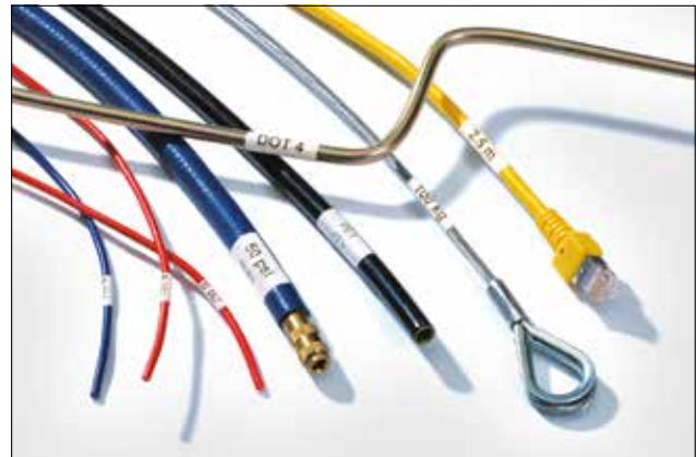
Easy marking of flexible, semi-rigid and rigid cables and wires.