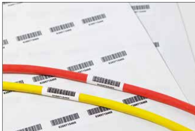
Laminating the mark gives long-term print survivability.