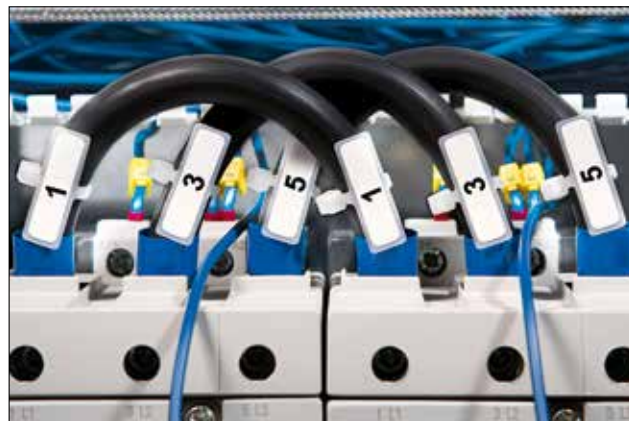
One operation with two user benefits.