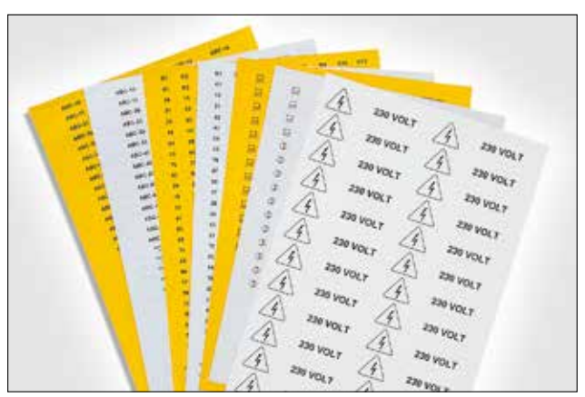
A precise match for Helafix, for permanent identification coding.