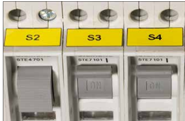
Clearly identified labels ensure easy network wire and cable management.