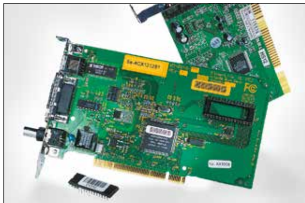
Secure identification of component parts and circuit boards with Helatag.