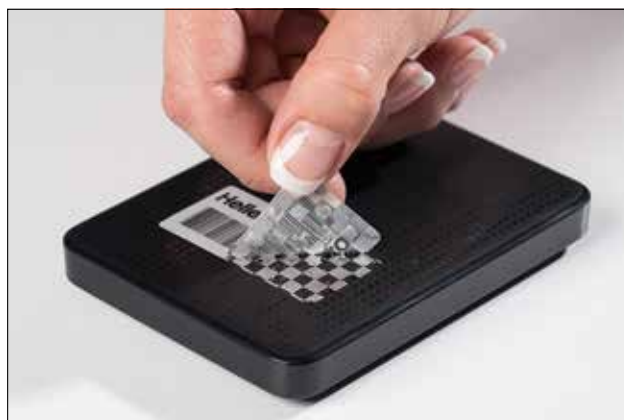
Highly visible tamper evidence.