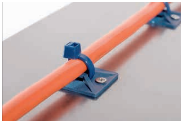
Detectable fixing solution containing of MCMB mount and MCT cable tie.