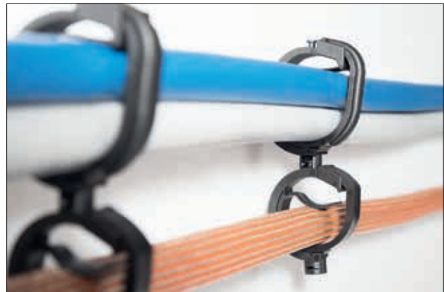
IAHC(J)AH in combination with an IAHC(T).