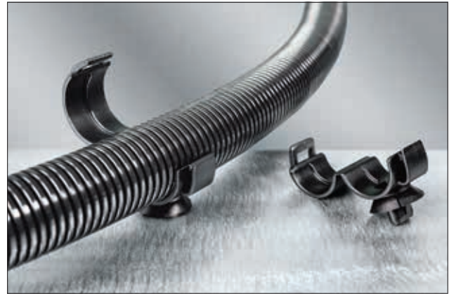
Simple and secure installation of pipes or hoses to panels.