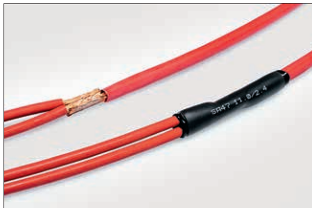
Heat shrink tubing SA47 for splice application.