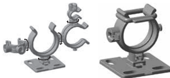
Multiple clips can be joined. Clips swivel freely.