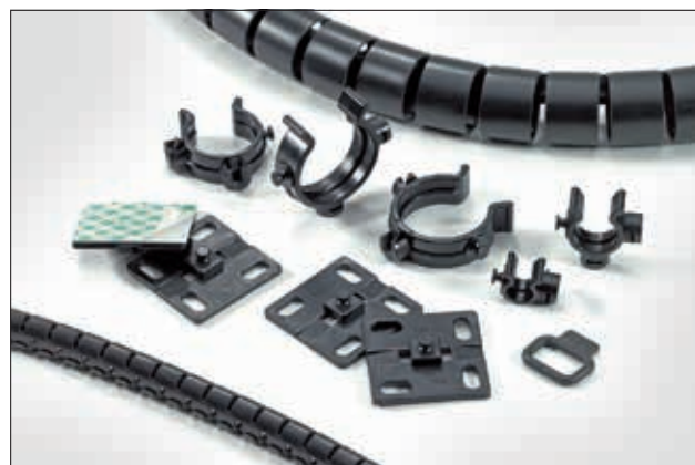
The Helawrap accessory set for bundling, fixing and protecting multiple cable runs.