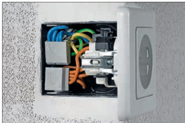
The compact design of HelaCon Easy fits perfectly in tight spaces.