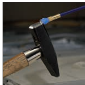
The strong magnet lifts a metallic tool of up to 2.5 kg.