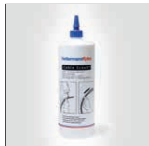
Cable Pulling Lubricant reduces friction during the installation of cables.