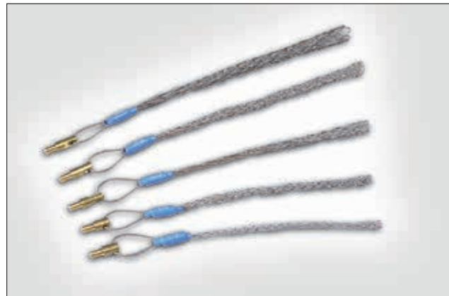
Cable Grips are available in five different sizes to attach a wide range of cable diameters.