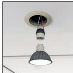
3. Connect the bulb to the socket and lock into the correct position.