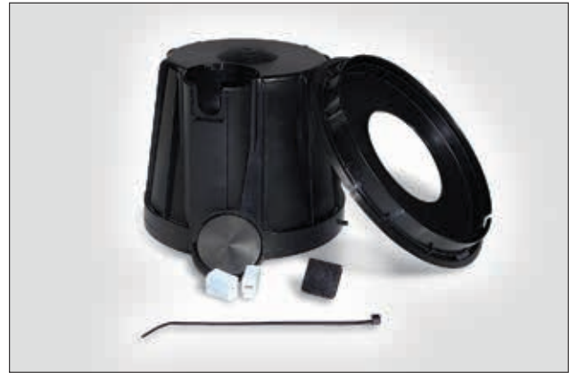
SpotClip-Box is a downlight cover supplied as a complete kit.