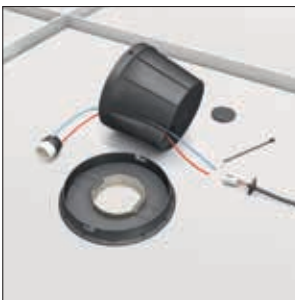
1. Mount the bottom plate over the drilled fixing hole and install the downlight housing.