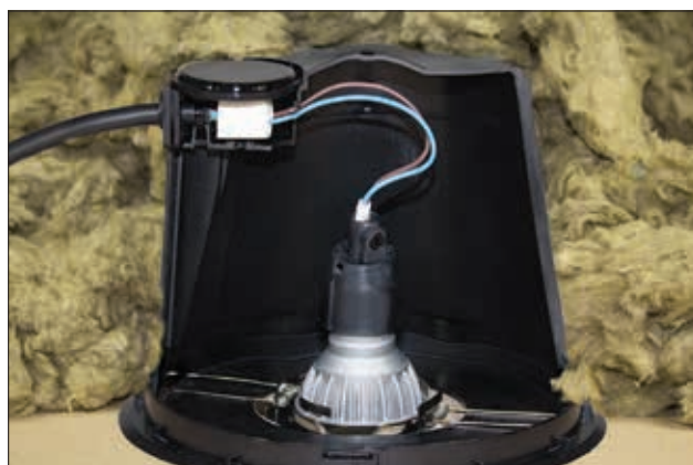
View inside the SpotClip-Box.