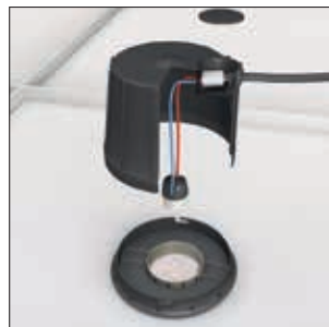
2. Connect the power supply to the lamp socket with the HelaCon Lux wire connectors included and lock it with the bayonet coupling.