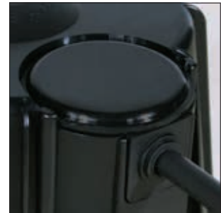
Seal the complete SpotClip-box using the end cap and grommet.