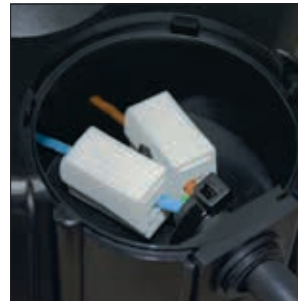
HelaCon Lux connected to the power supply.