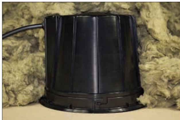
SpotClip-Box - Especially designed for passive house applications.

It is available as a complete kit, including HelaCon Lux wire connectors and all necessary mounting components.