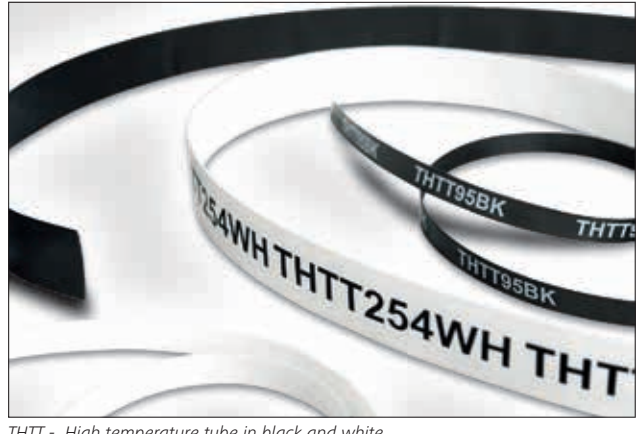
THTT - High temperature tube in black and white.