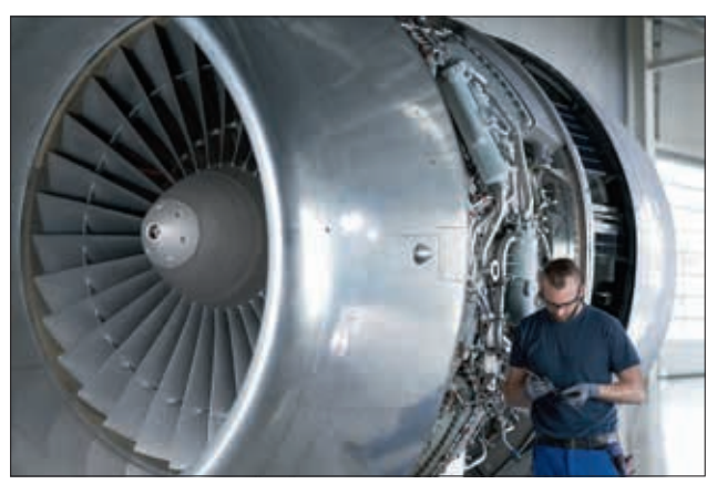
Aerospace-specific products offer best solutions.