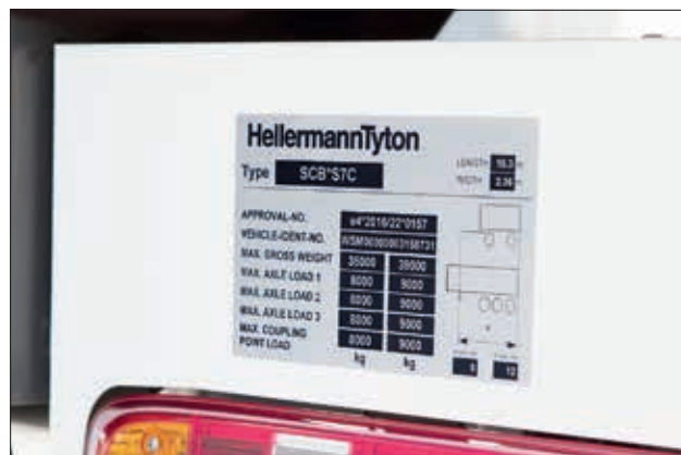
Type plate of an HGV trailer with protective laminate.