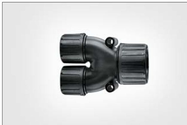
HelaGuard HG-Y, Y-Connector, IP66.