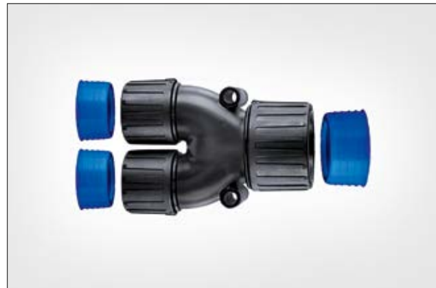
HelaGuard HGL-Y, Y-Connector with conduit seals.