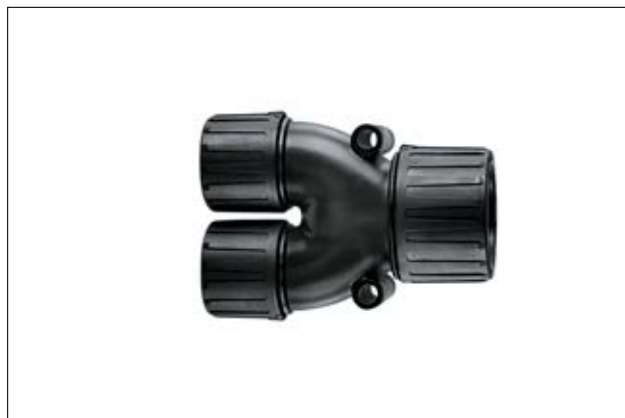
HeliaGuard HG-Y, Y-Connector, IP66.