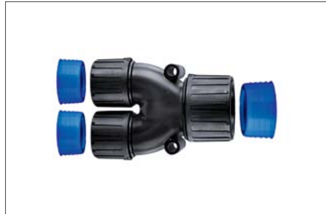
HelaGuard HGL-Y, Y-Connector with conduit seals.