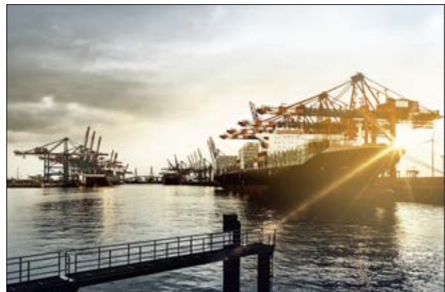
HelaGuard LTSH galvanised steel conduit with a smooth, liquid-tight thermoplastic rubber cover offers very good resistance to oils, greases, petrol and acids.