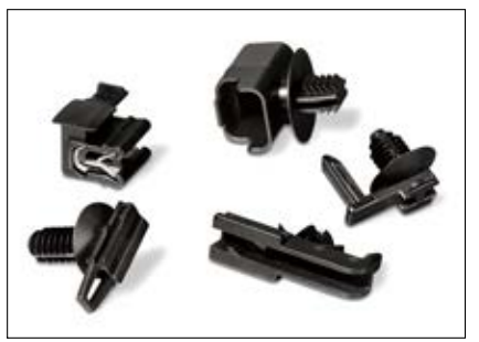
ConnectorClips are available for many different connector types and fixing varieties.