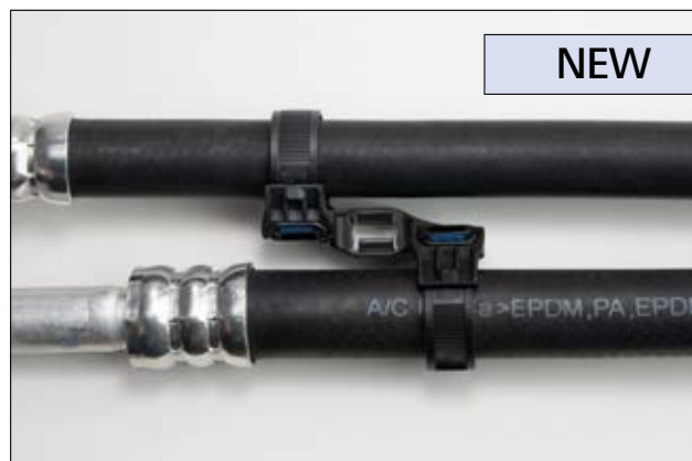
The Soft Grip Tie in combination with the Soft Grip Mount for studs (weld studs) for parallel guidance of hoses in fluid management.