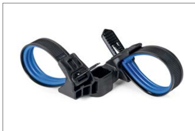
Soft Grip Cable Tie assembled with Soft Grip Mount for studs (weld stud).