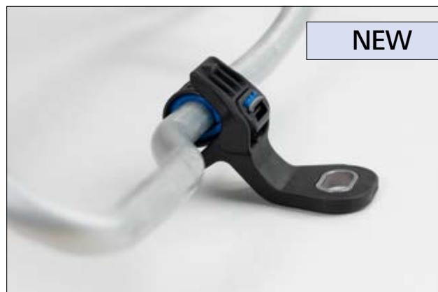
Soft Grip Cable Tie assembled with Soft Grip Mount for screw fixing e.g. for fluid management / air conditioning pipes.