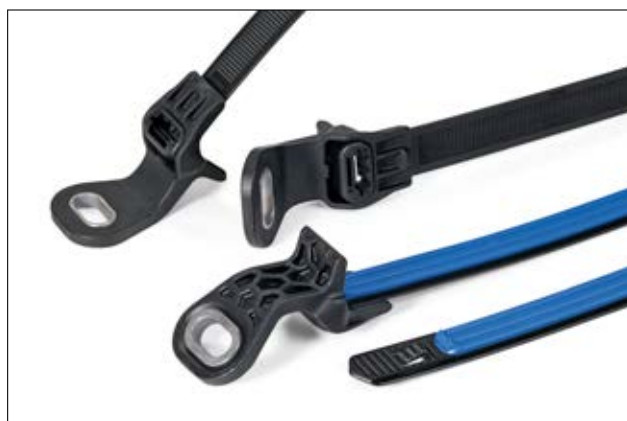
Soft Grip Cable Tie assembled with Soft Grip Mount for screw fixing.