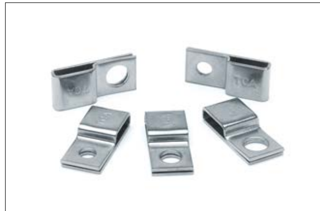
Stainless Steel P-Mount SSPC for use in arduous environments.

Material specification please see page 26.