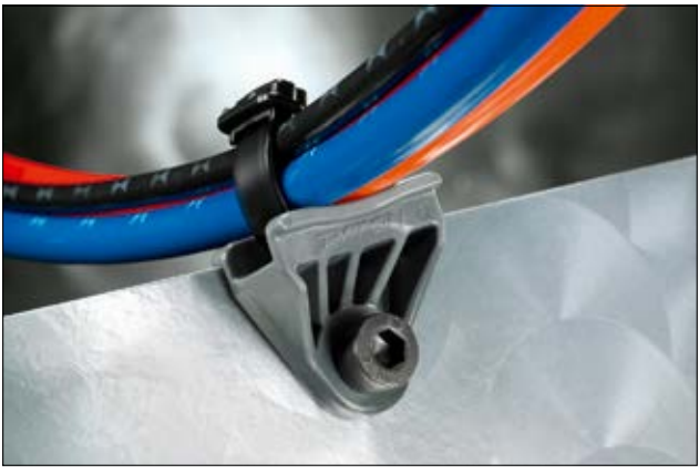
Axial oval mounts stand off bundles from frame rails and cross members to prevent them from rubbing and chafing.