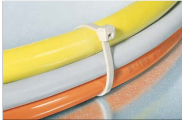
The PEEK cable tie PT220 for high temperature applications.