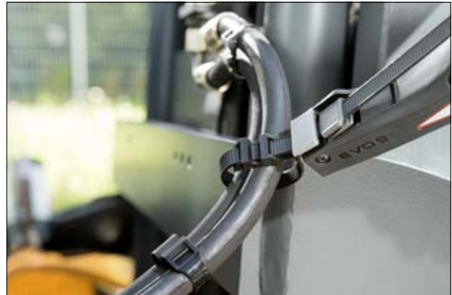
LPH-Series with a smooth surface to the bundle.