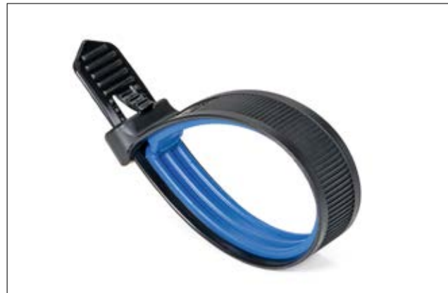
Soft Grip Cable Ties (2-component cable ties).