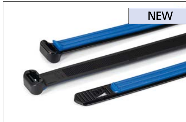
Soft Grip Cable Ties (2-component cable ties).