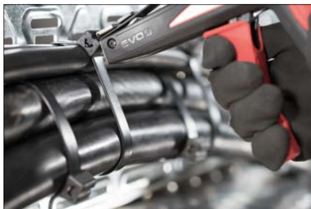
EL-TY straps can be cut to suit any bundle with application tool EVO9.