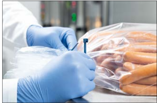
Detectable and reusable Cable Ties for temporary closure.