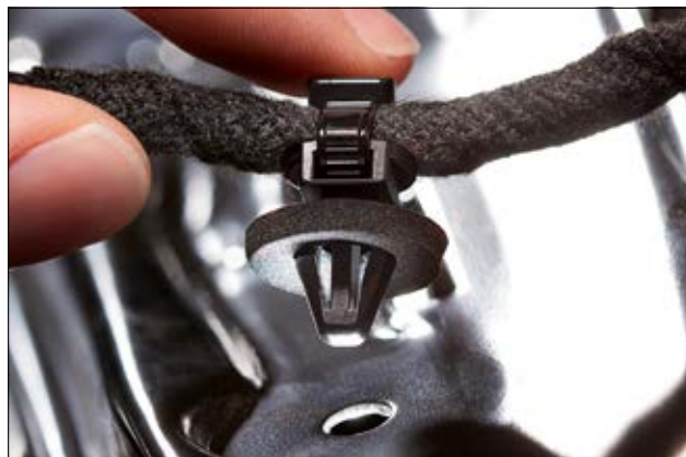
The additional seal protects against the ingress of moisture.