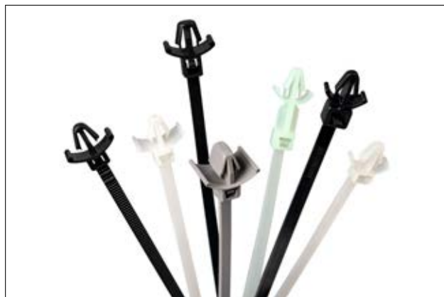
A wide range of arrowhead fixing ties which are suitable for different panel thicknesses and hole diameters.