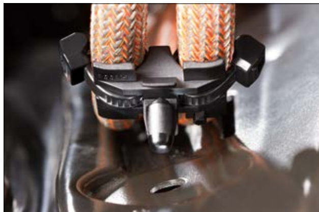
T50SOSDSFT6.5 for parallel routing.