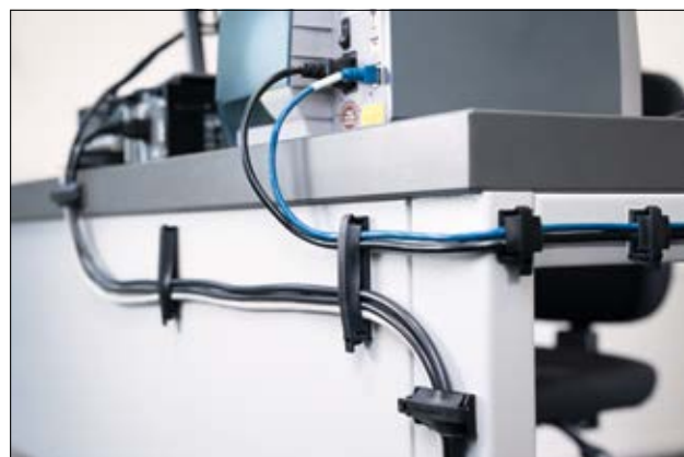
Perfect solution to route cables along the office desk.