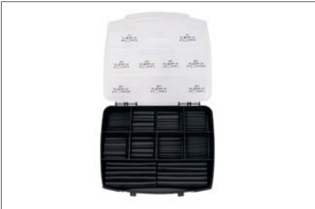
ShrinkKit 321 Basic - 220 pcs 3:1 heat shrink assortment.