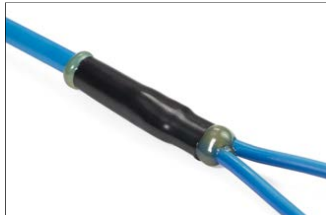
TA46 - Environmental sealing, insulating and protecting inline wire splices.

All dimensions in mm. Subject to technical changes. Minimum Order Quantity (MOQ) may differ from package content.